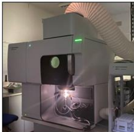
Figure 3: Ion Analysis