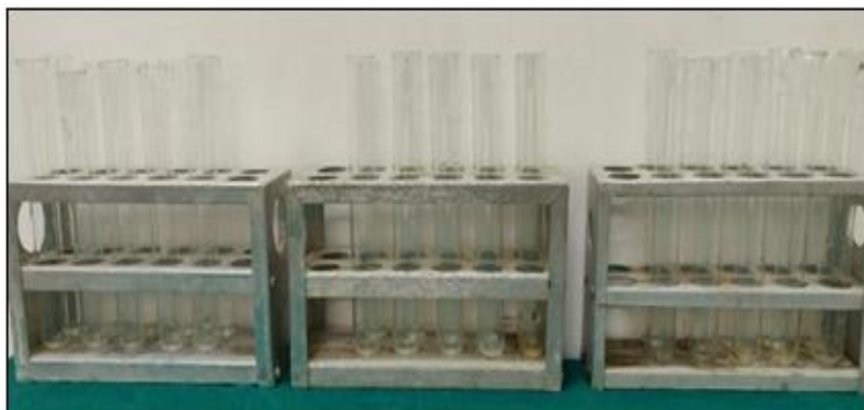
Figure 2: Specimen stored in de-ionized water